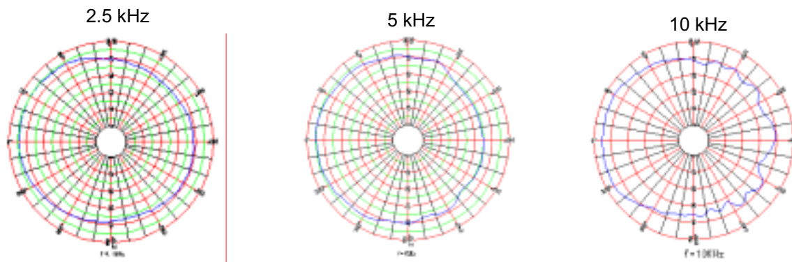
Figure 2: Directional response of the MP205 microphone.